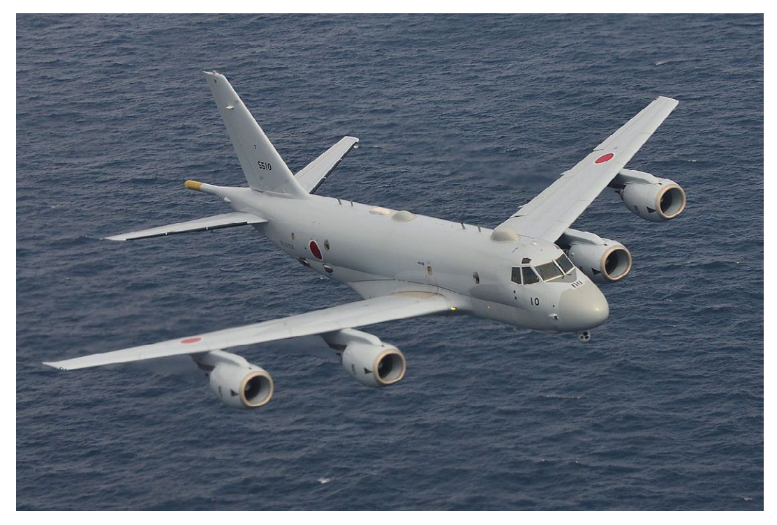
Kawasaki P-1 MPAs.

Meanwhile Russia has also been modernising its military forces, with Syria a testing ground for new aircraft and drones, precision weapons and electronic warfare (EW). It has also announced a range of future weapon projects such as air-launched hypersonic missiles, underwater nuclear torpedoes and nuclear-powered cruise missiles. However, it is unclear to Western analysts how many these high-profile projects will even enter service, given increasing development costs. A case in point is Russia's T-14 Armata tank and the Su-57 PAK-FA stealth fighter - both of which, after vast publicity and sending