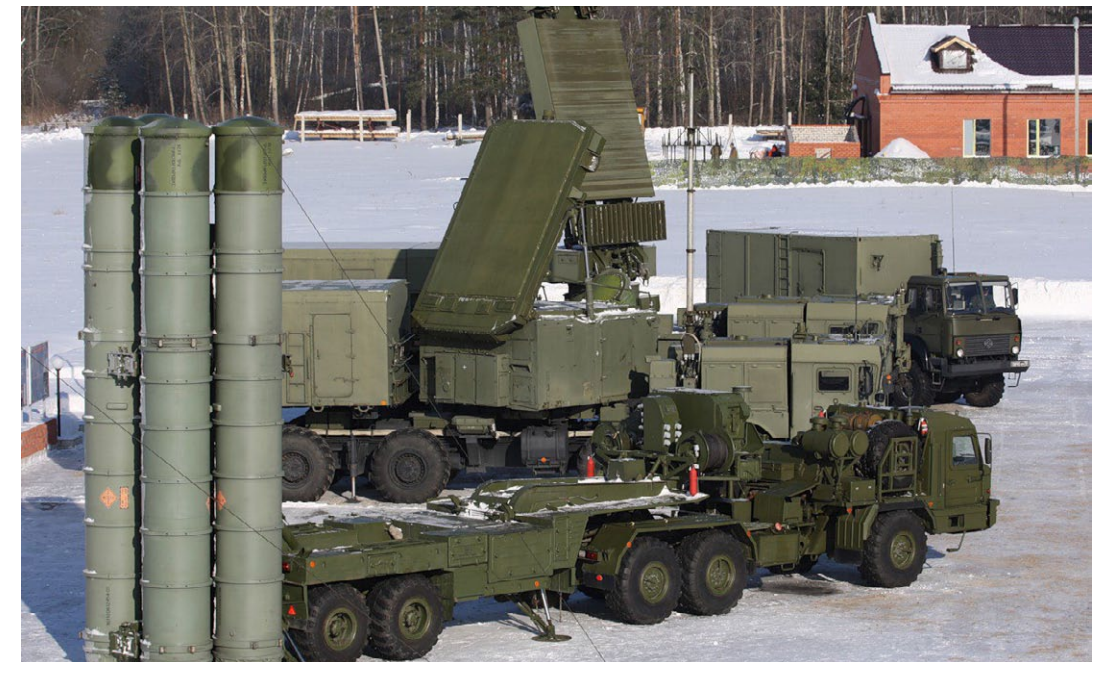
S-400 SAM in position.

The annexation of Crimea in 2014 too is a case in point. Despite much condemnation in the West for this and Russian meddling in Eastern Ukraine, the shootdown of MH17, the international community has effectively left Crimea to its fate – the first border-change in Europe in decades. Inadvertently, then perhaps, Moscow by utilising 'hybrid