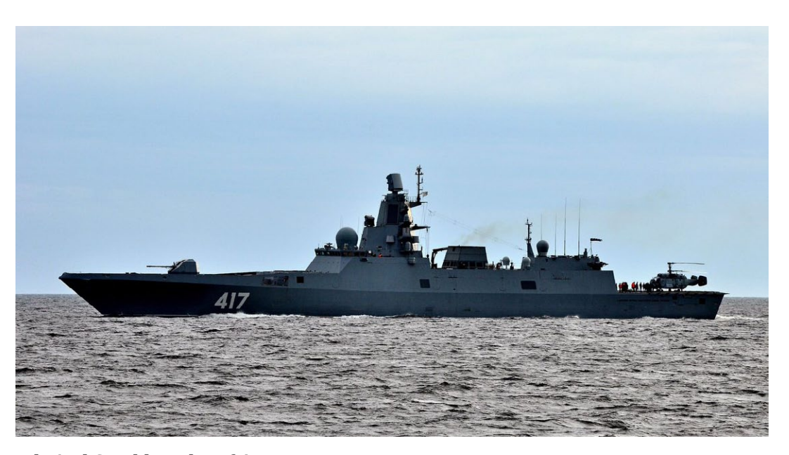
Admiral Gorshkov-class frigate

Perhaps ironically too, it is also Tsushima veteran, Admiral Yamamoto who is associated with the phrase: 'I fear all we have done today is to awaken a great, sleeping giant' when talking about the attack on Pearl Harbor. Could a conflict in the Kurils today also awaken a sleeping bear in Moscow?